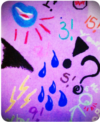
"Letter to my Father" by Emily

Trauma negatively impacts the speech pathways in the brain — it can literally silence. However, the process of creating art can help heal these pathways, often allowing participants to process and share parts of their lives they may not otherwise have even been able to access.